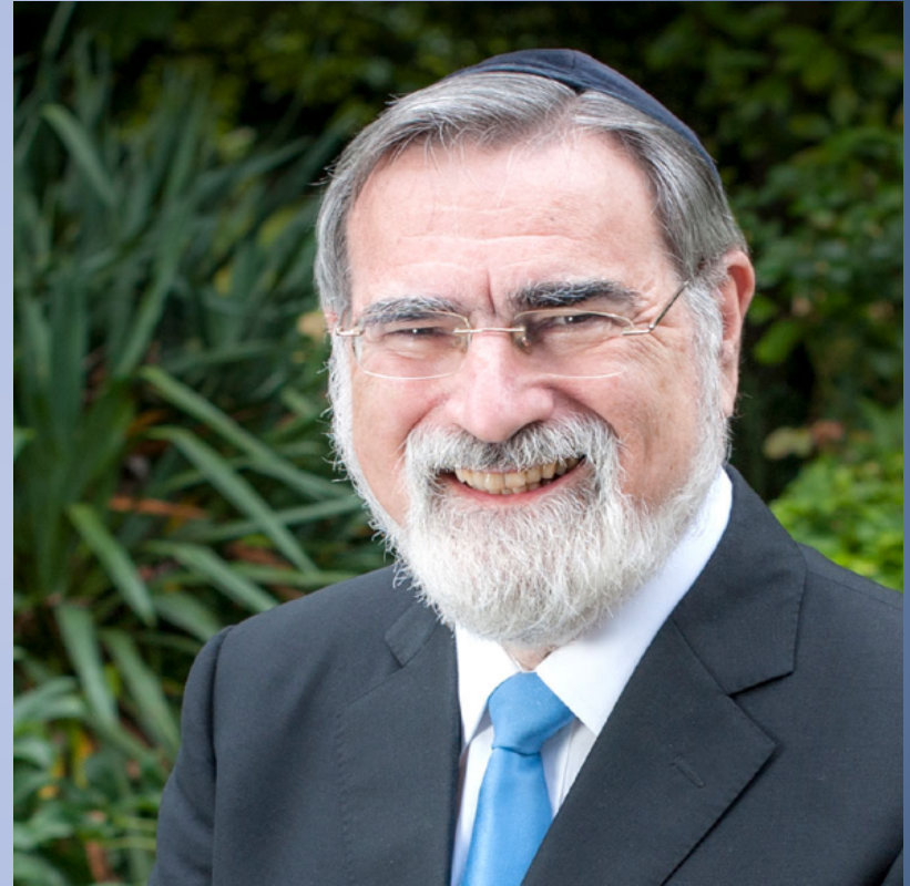
Rabbi Jonathan Sacks

“When it comes to rebuilding a shattered world, you do not wait for permission.”