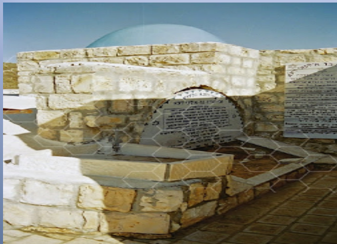
Tomb of R. Yehuda in Galilee