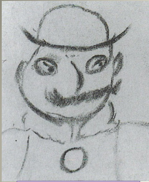
Joyce's sketch of Bloom

“Mendelssohn was a jew and Karl Marx and Spinoza. And the Saviour was a jew and his father was a jew. Your God... Your God was a jew. Christ was a jew like me.”