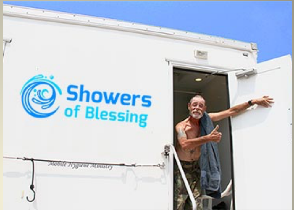
Mobile shower for the homeless