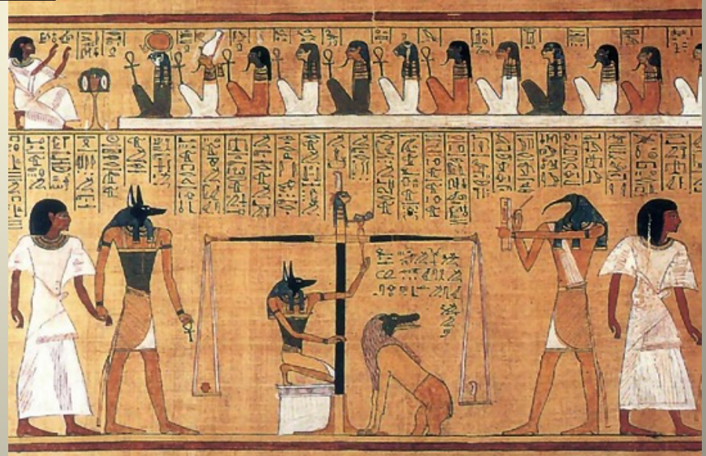
from the Egyptian Book of the Dead